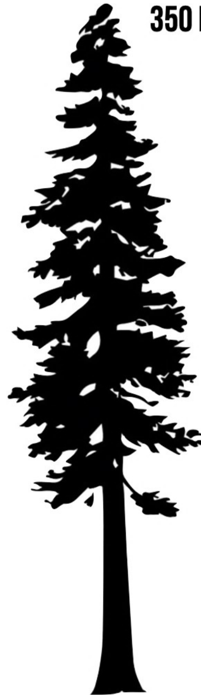
REDWOOD 350 FT.