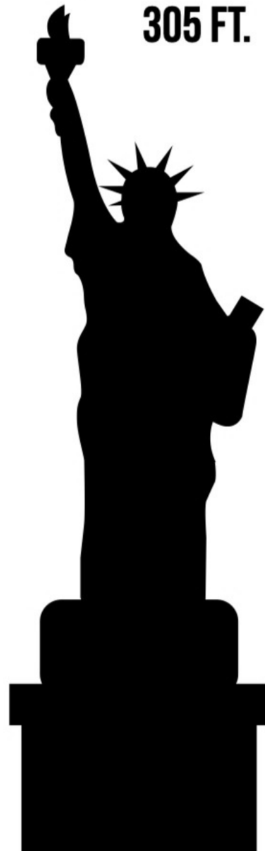
LADY LIBERTY 305 FT.