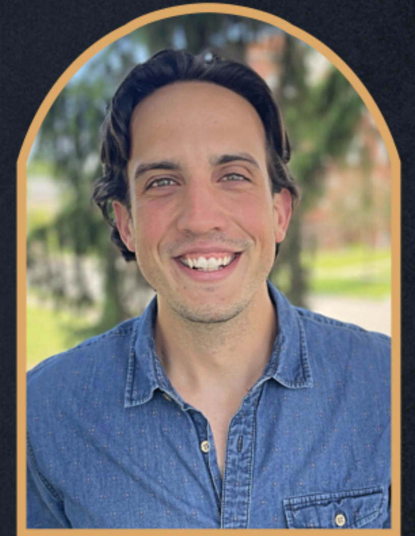
AUGUST 25 TYLER HENRY