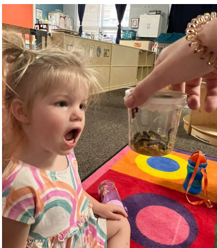
The Toddler 2 caterpillars!