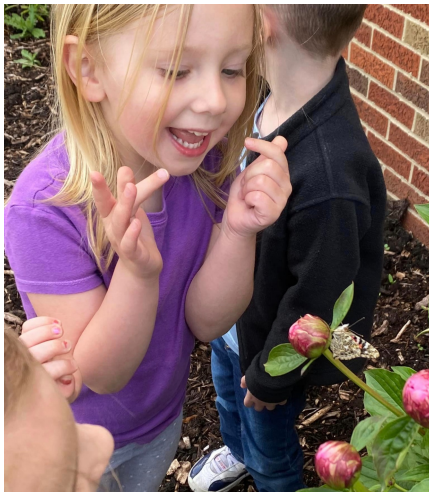
The Middles butterfly launch!