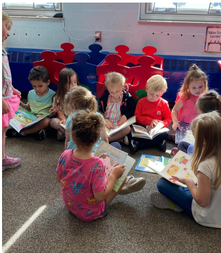
Reading time with the Middles!