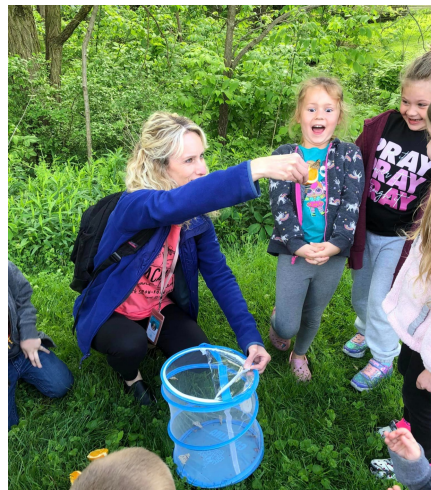
Pre-K releasing their butterflies!