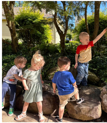
Some outdoor time with Toddler 2!