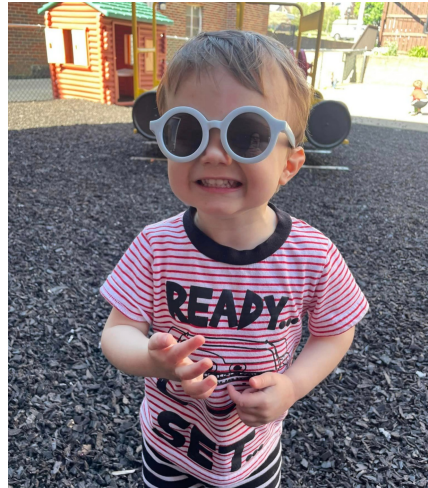
The Toddler 1 Class has some pretty cool kids!