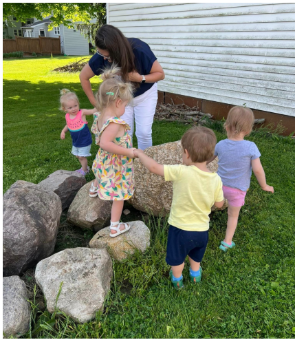
Miss Crystal spending time with the Toddler 2 Class!