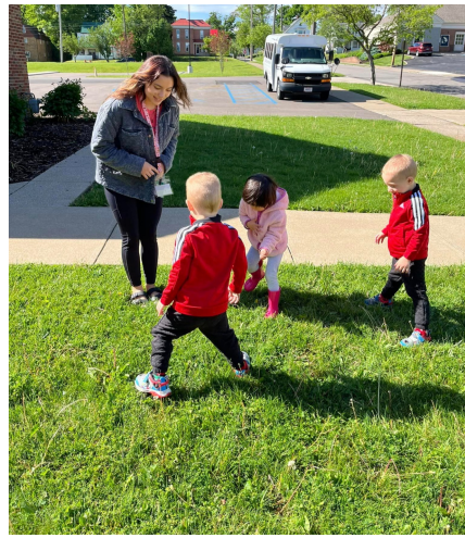
Outdoor time with the Littles!