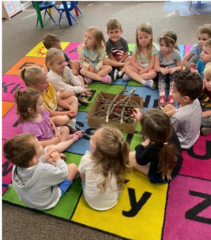
Campfire fun in the Middles Class!