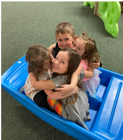
The Middles showing some love!