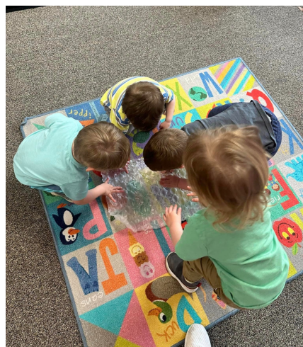
Bubble wrap fun for Bubble Week!