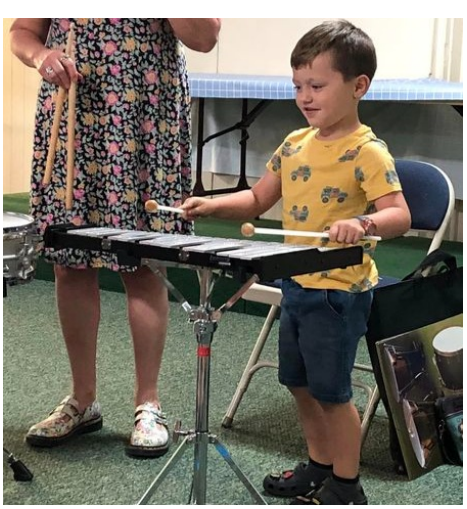
Four Week Instrument Petting Zoo with the Ashland Symphony Orchestra