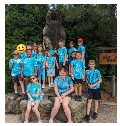
School Age Trip to the Akron Zoo