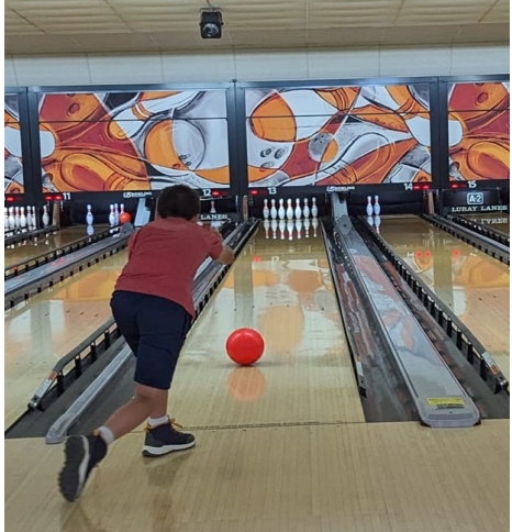
Bowling at Luray Lanes