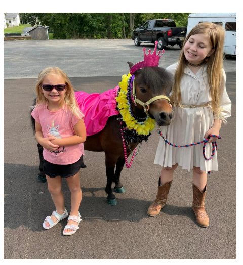
A Pony Petting Zoo for All Ages