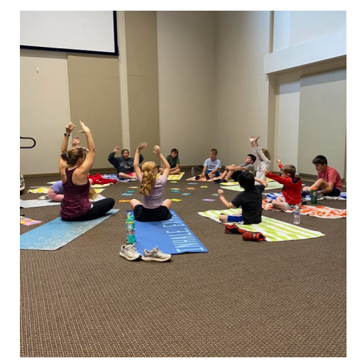
Weekly Yoga With a Christian Basis

For those of you who may not know, Park Street School provides a summer program for Toddlers all the way through Fifth Grade. This summer was so much fun and so very busy! Each week we had yoga, music and movement, and art class. The school agers had biweekly trips to the Ashland Public Library to check out books followed by a trip to a local restaurant for lunch or a treat. Each Wednesday, the school agers traveled to the band shell for the Ashland Public Library summer programming. We had a school-wide pony petting zoo and Busy Bee Expressions came for a stuff a plush party. We did so many other things as well! If you would like to check out the other activities, you can look back at the summer months on the Park Street School Families Facebook page. We hope you can join us next year for our summer program!